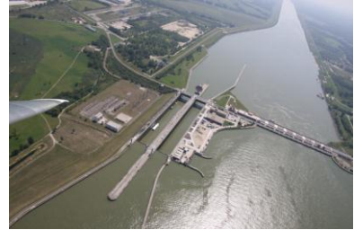
Győr airport, thermal spa at Mosonmagyaróvár, dam at Gabčíkovo