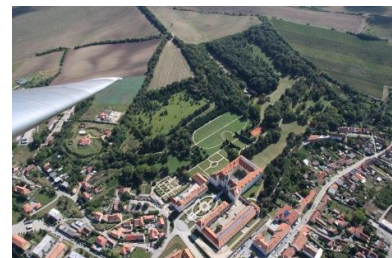
VW development site at Devinska n/Ves, Valtice area, Valtice castle,