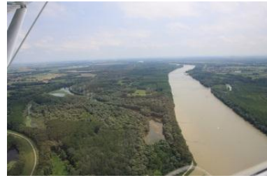
„Slovak Hungaroring“ in Orechova Potôň, state borders along river Danube, river Danube curves