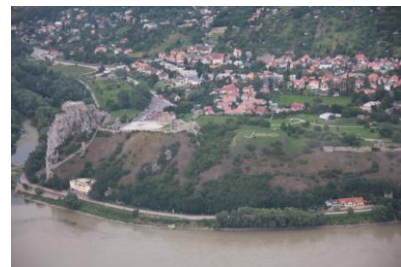
"Chuk Noriss" Cycle Bridge, blurred Bratislava, Devín castle